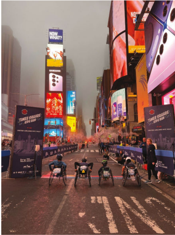
Our athletes line up for the Times Square Kids Run at the United Airlines NYC Half.